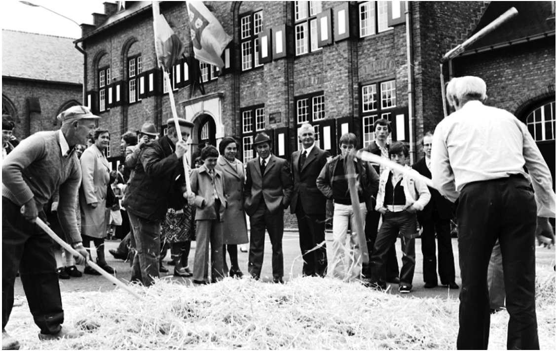
FIGURE 3. Flailing demonstration in Westrozebeke, July 1978