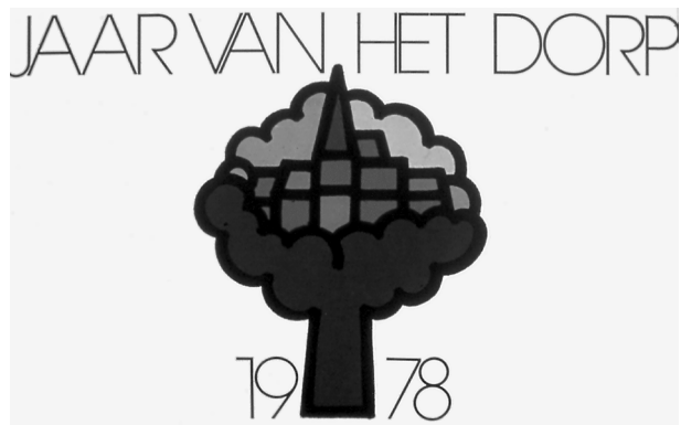
FIGURE 2. Official logo of the ‘Year of the Village’

fairs were meant to be a source of inspiration for local administrators and an opportunity to exchange ideas on campaign projects. Screenings of the slide show and film were arranged and ample quantities of the brochures and promotional items were distributed among interested parties. Every participating national, regional or local institution was assigned an information stand. The fairs lasted for several days, with no entrance fee to encourage the largest possible attendance. Livened up by village-themed events such as orchestras, folk dances, puppet theatre, crafts demonstrations and even a circus, the explicit goal was to lure in young families and ‘introduce children to rural issues’. Entire Flemish schools visited the exhibitions, during which the National Service presented their teachers with teaching materials. Pupils were invited to participate in provincial drawing and essay contests on the subject of the countryside. The Dorpskrant even featured an article enumerating several possible ‘Year of the Village’ projects for elementary schools. 57