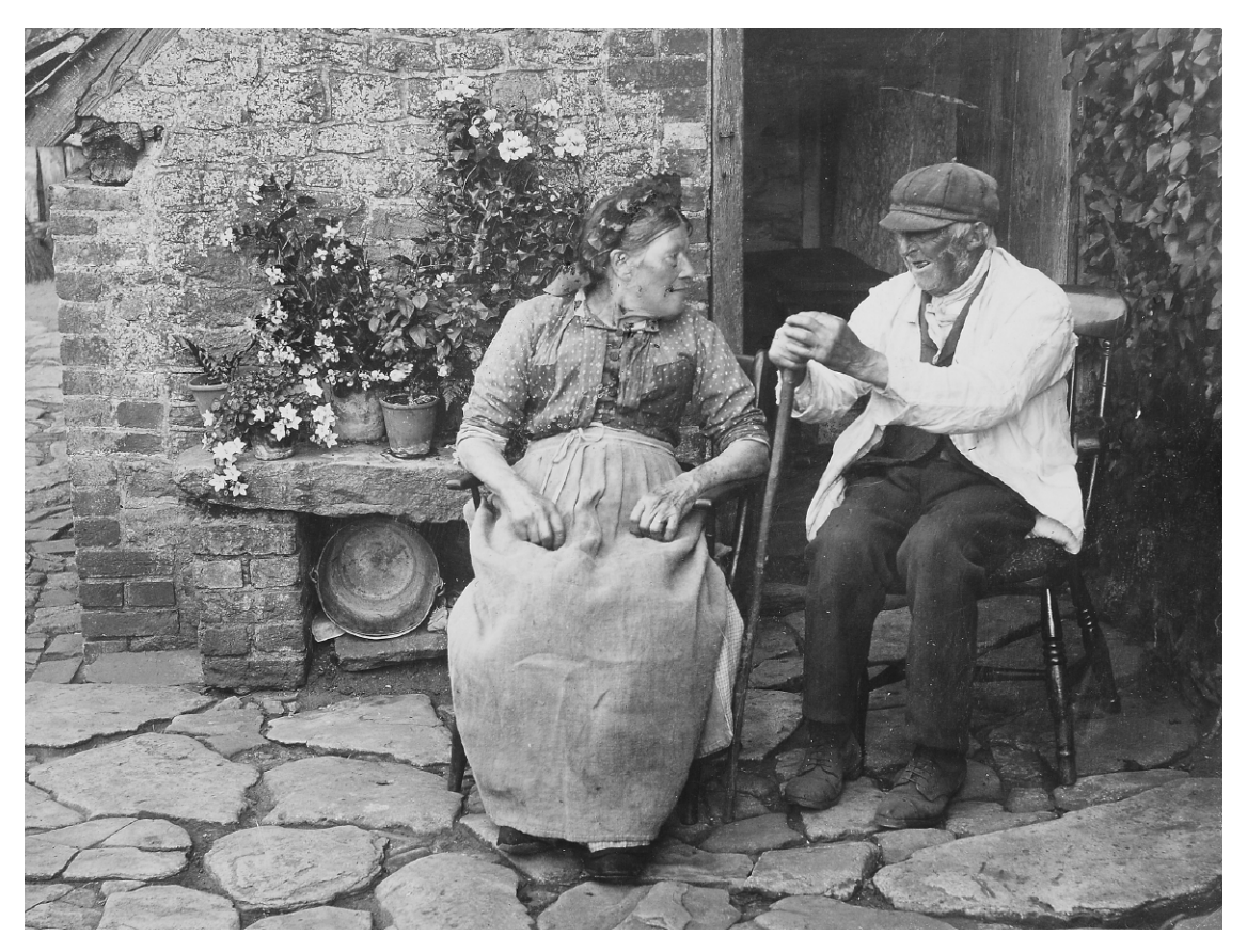
FIGURE 1. 'Cottagers and their pot plants', original photograph from Gertrude Jekyll, Old West Surrey: some notes and memories (1904), Surrey History Centre, 6521/2/2/287. Reproduced by permission of the Surrey History Centre.

Source: F. Liardet, 'State of the peasantry in the county of Kent', Central Society of Education (1839), pp. 101–2, 117, 120.