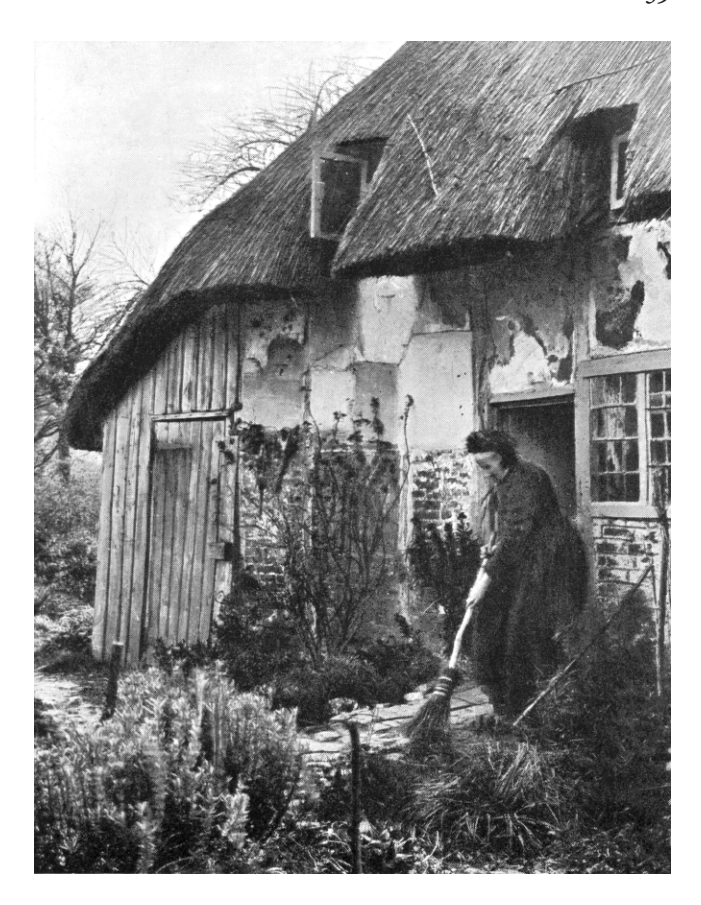
FIGURE 2. Thatched cottage, Balcombe (West Sussex), c.1900, PP/WSL/PC001054, West Sussex County Council Library Service www.westsussexpast.org.uk